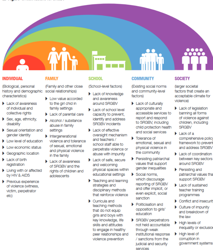
■ Figure 4: Risk factors for SRGBV