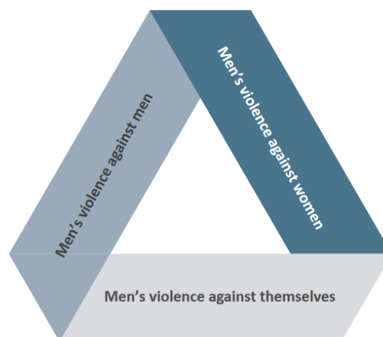
Figure 3: Triad of men's violence